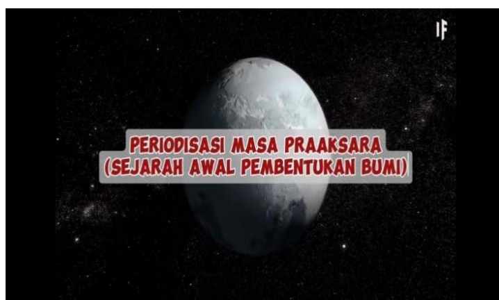
Figure 2. Learning Video Display

The learning media developed is based on the primary teaching materials used by teachers, namely the social studies book of the Ministry of Education and Culture, the independent curriculum as a master plan, then supplemented with the latest data, facts and information so that it turns into a teaching media based on books and adjusted to student character. The process of developing the researcher's learning video combines several images and videos that are related to the material. The images and videos are taken from Bing.com and YouTube.